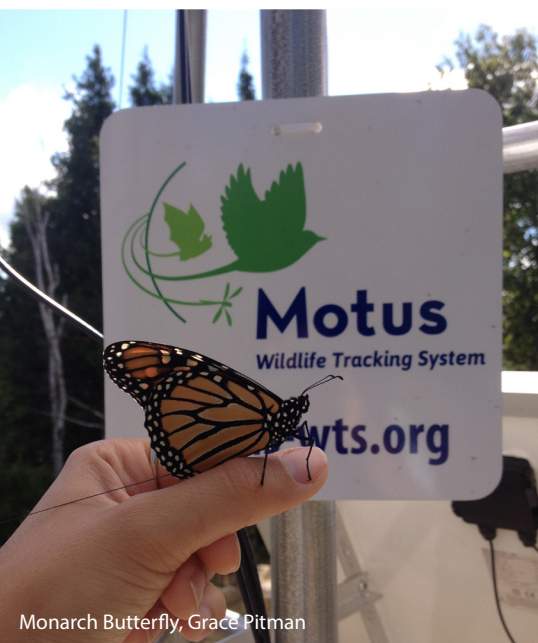
Monarch Butterfly, Grace Pitman

This document outlines the expectations and responsibilities of the collaborating individuals and organizations that comprise Motus.