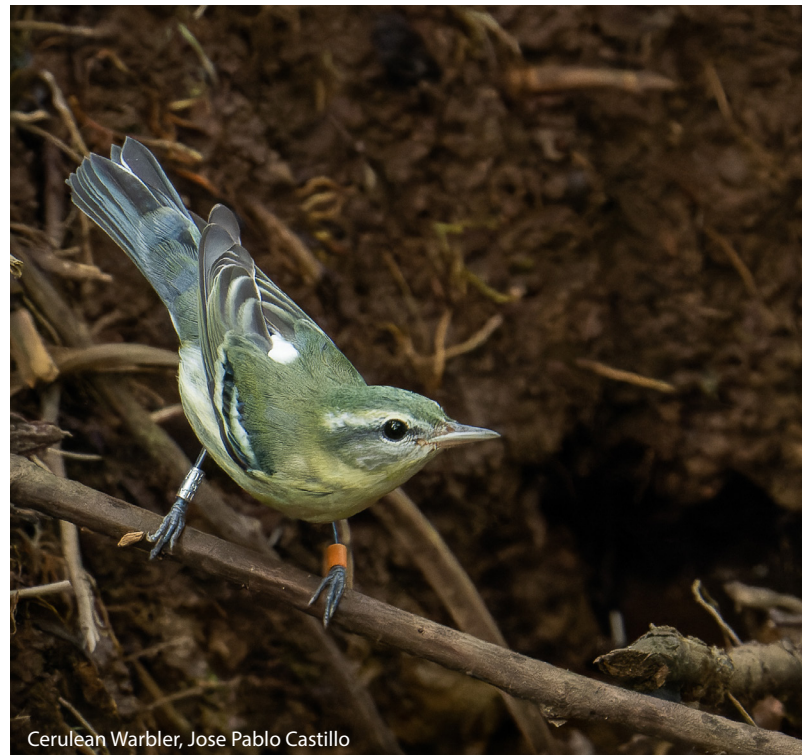
Cerulean Warbler, Jose Pablo Castillo

Collaborators should keep in mind that in most cases, the temporal and spatial resolution of publicly available data will usually not be detailed enough to represent a conservation concern, or be useful to compete with any research or publications interests of the investigators.