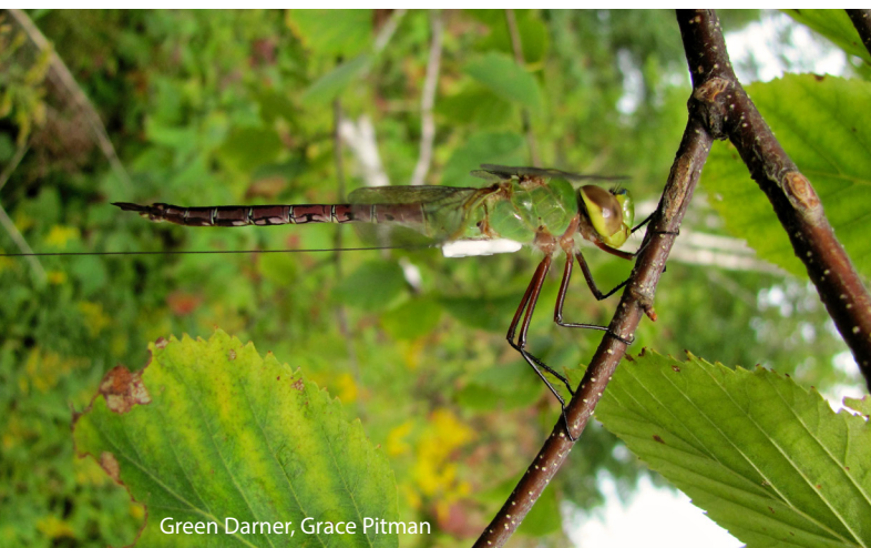
Green Darner, Grace Pitman

science, conservation and wildlife management through scientific publications, interpretation, visualization and increased public engagement. Critical to this goal is a FAIR (Findable, Accessible, Interoperable, and Reusable) open data framework that facilitates data sharing and collaboration among researchers while ensuring appropriate permissions and acknowledgement to project collaborators and participants. The model framework is largely analogous to eBird, or bird banding/ringing programs, where all data are submitted to and coordinated by a central repository that is open and freely available to all.