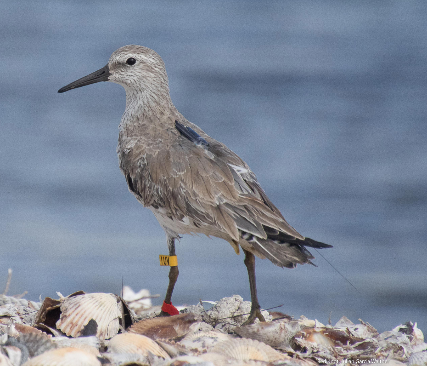
Red Knot