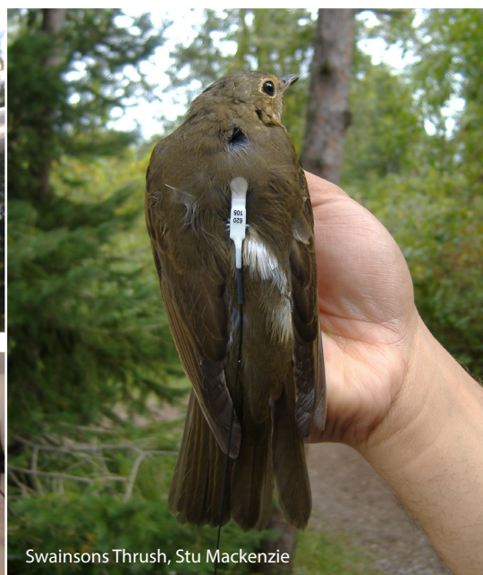
Swainsons Thrush, Stu Mackenzie